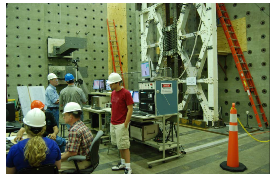
Hosted by the Mid-America Earthquake Center at the University of Illinois Sponsored by Asian-Pacific Network of Centers for Earthquake Engineering Research

Workshop website: http://illinois.edu/goto/ANCER